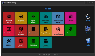
Main Menu 23

The new Etere release shows a complete redesign of it's GUI. The product is now more easy to use and with the best GUI of the market