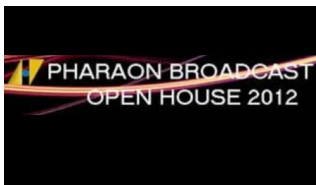
Pharaon Broadcast Open House company logo