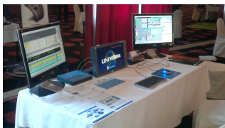
Booth at Pharaon Open-House 2012