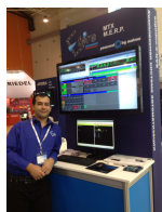
Etere NAT EXPO 2012

The 3-day event on 6/8 November brings a lot of new opportunities to Etere. At NATEXPO, Etere has renewed the success of its products in the Russian market being proudly supported by SVGA, its local distributor. At the stand it has captured all broadcasters' attention.