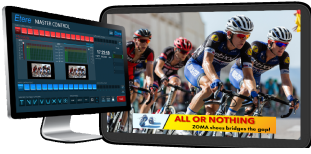
Channel in a box Etere ETX