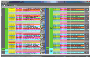
Strategic Editor - Main View

Comprehensive and rich functionality for easier and faster schedule management