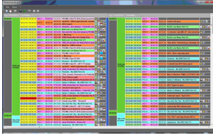
Strategic Editor - Main View

Comprehensive and rich functionality for easier and faster schedule management