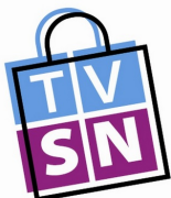
official logo of TVSN

The Rural Health Channel is the first nationally available free-to-air health TV channel. The Rural Health Channel began broadcasting on the May 2012, and it transmits Rural Health Education Foundation professionally accredited programs as well as health education information and programs from other providers such as government, professional organisations and health associations. The Channel gives other organisations wishing to connect with those living and working in rural and remote Australia an effective, regular and targeted communication channel. TVSN, Rural Health Channel's owner, has confirmed Etere as the provider for the playout automation system, the customer's choice to confirm Etere reliable software comes from their need to rely on an integrated consistent solution for the management of their valuable and increasing assets.