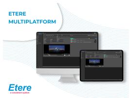
Etere Web Multiplatform

Released as part of a global initiative, Etere is now available in Arabic GUI for an enhanced experience for users from all around the world. The new GUI is available on both the Etere Web and desktop application.