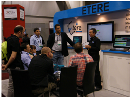
NAB Show 2012