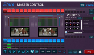
ETERE MASTER CONTROL