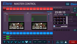
ETERE MASTER CONTROL