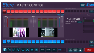
etere master control

Etere ETX is the most advanced, and cost efficient video management system in the market today. It is 4K ready and a complete channel in a box with full IP (in and out) for multiple frames rates. It is able to drive the most popular HD/SD digital video/audio/graphics platforms without using middle-ware/proprietary hardware. ETX is a fully digital ingest/playout engine that gives you professional video technology with support for all major essences and wrappers in the broadcast industry.