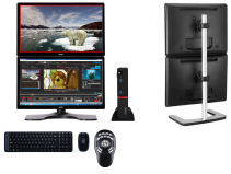
Censorship Dual Monitor

Etere CensorMX now has a new version, the Etere CensorMX Simple , optimised to provide the necessities of seamless censorship at a lower price.