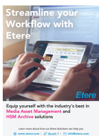
golden eye etere advert

Find out about Etere's brand new software programs such as Radio Live, and hear more about our acclaimed MAM solution and revolutionary end-to-end solution, the Etere Ecosystem. Book an appointment with us now for an in-depth demonstration of Etere solutions!