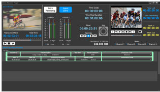
Live Sports Player