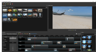
Video Editor Main Interface