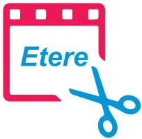
Etere Video Editor

Etere is proud to announce Etere Video Editor the latest extension of the Media Asset Management solution. Integrated with MAM, users can easily edit assets directly from MAM database.