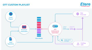
OTT Custom Playlist

Etere transforms the way to deliver and monetize media content in a data-driven way. Its latest release is the Over-The-Top (OTT) playlist generation which enables multiple sub-playlists to be generated from the main playlist with Etere ETX. These sub-playlists are driven by business intelligence and the agility to adapt content to the viewer's profile.