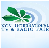
KYIV International TV & Radio Fair

Etere will be exhibiting its software solutions at KYIV International TV & Radio Fair 2019 that will be held from May 29-30 2019 at Ukraine, Kiev, Kyiv, ACCO International EC. See you there!