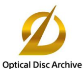
Optical Disc Archive