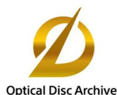
Optical Disc Archive

Etere HSM's seamless integration with the Sony Optical Disc Archive platform empowers Studio Vision with the full flexibility to leverage on Sony's capabilities. Sony ODA is a tapeless high capacity digital archive system that can be used for