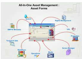
MAM asset form

National Archives of Australia maintains the records of the Australian Government agencies that form the archival resources of the nation. It manages nearly 500,000 audiovisual assets in multiple formats including motion picture films, videos, audio recordings and digital formats created by the Australian Government. With the integration of Etere Media Asset Management (MAM) , the National Archives of Australia is empowered with one of the most efficient software tools available on the market to manage and control its collection of audiovisual assets.