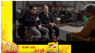
Ad Insertion Squeeze