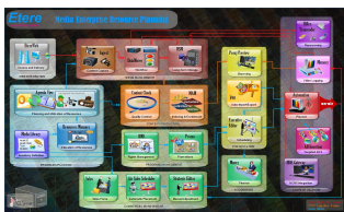
The Etere Framework

Etere will be showcasing the latest Etere plugin for Adobe Premiere Pro CC at NAB Show 2018 from April 9th to 12th at Las Vegas Convention Centre, Booth SL5516 (Pod 6). Etere Media Enterprise Resource Planning (MERP)'s flexible architecture, high reliability, and efficiency provide a centralized management of digital content and integrative workflows for all your broadcasting needs. Etere's plugin for Adobe Premiere Pro CC features seamless integration with Etere MERP solutions to provide all the professional tools needed from a single interface, without exiting the NLE environment.