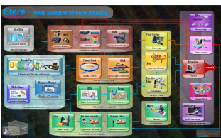
The Etere Framework

Etere will be showcasing the latest Etere plugin for Adobe Premiere Pro CC at NABshow 2018 from April 9th to 12th at Las Vegas Convention Centre, Booth SL5516 (Pod 6). Etere Media Enterprise Resource Planning (MERP)'s flexible architecture, high reliability, and efficiency provide a centralized management of digital content and integrative workflows for all your broadcasting needs. Etere's plugin for Adobe Premiere Pro CC features seamless integration with Etere MERP solutions to provide all the professional tools needed from a single interface, without exiting the NLE environment.