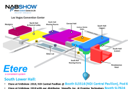
Etere at NABshow 2018 Floor Plan