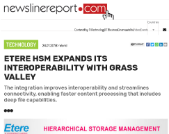
Newsliner Report Jan 2018