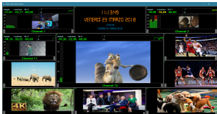
ETX-M IP Multiviewer