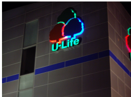
Building of U-Life