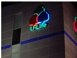
Building of U-Life