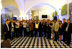
Laos Business Mission 2017