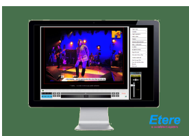
Etere Player installation