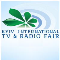
Etere at KYIV

Etere will be exhibiting its Media Asset Management(MAM) solutions at Kyiv International TV and Radio Fair 2017, to be held at the Kyiv, ACCO International Exhibition Centre in Kiev, Ukraine, Booth 5, from 18th to 19th May 2017.