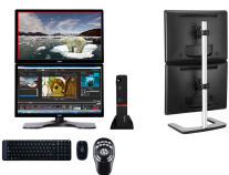
Censorship Dual Monitor