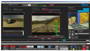
Multiple Audio Tracks Feature