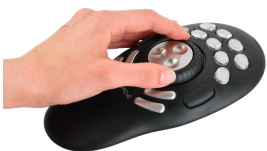
CensorMX Shuttle Pro Contour