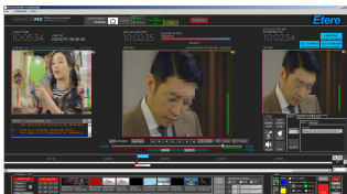
Mosaic Effect Feature