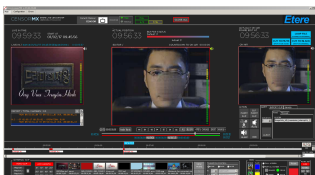
Blur Effect Etere CensorMX

With the upgrade, CensorsMX is able to manage a variety of file formats including TGA, JPEG and BMP. Image upload is easier and faster.