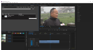
Screen Adobe Premiere Pro