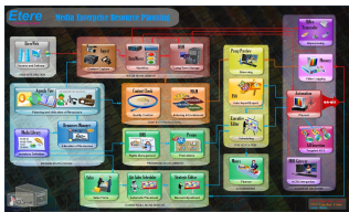
Media Enterprise Resource Planning