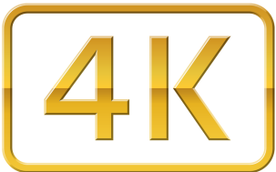
4K is supported