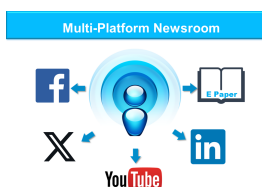
Nunzio Newsroom Multi- platform

4K technology sets the stage for a truly immersive and cinematic experience. Be at the forefront of technology with Etere 27.1 which includes ETX with 4K compatible technology, capable of delivering a truly exceptional video quality: