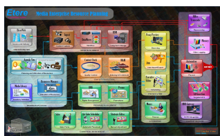
Media Enterprise Resource Planning