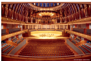
Esplanade – Theatres on the Bay