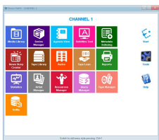
Etere MAM Menu