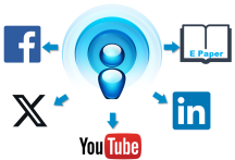
NRCS Multiple Platform Compatibility