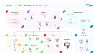
Nunzio Newsroom Workflow