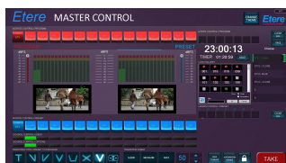
ETERE MASTER CONTROL