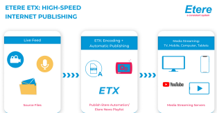
Workflow of ETX Streaming