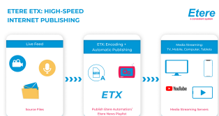
Workflow of ETX Streaming