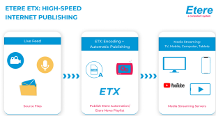
Diagram of ETX Streaming

Etere ETX launches automatic and high-speed internet publishing as a free upgrade.