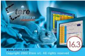
Etere 16.3 solution

ETERE has a huge vantage against competitors because is the only company worldwide able to offer a complete solution for your TV station using a shared framework to manage all the television business: automation, scheduling, air-time sales, traffic, media management and indexing, archiving, news, recording/ingest, video logging and audience control, web, etc.