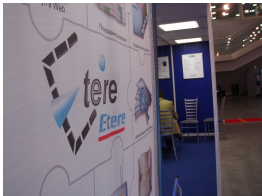
NAT EXPO 2006

ETERE will show to broadcasters an edge technology solution that includes more features than any other in a single common framework. ETERE will show at NAT EXPO its famous ETERE Media Management, Traffic, Automation and other software solutions for TV stations of any size and any type. ETERE Automation is practically the most powerful, the most scalar and the most reliable automation system among all systems offered on market.