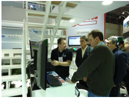
Broadcast & Cable Brazil 2011