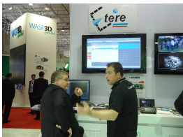
Broadcast & Cable Brazil 2011

Etere renew its presence at the most important broadcasting event in Latin America: SET Broadcast & Cable.