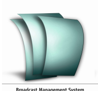
Broadcast Management System