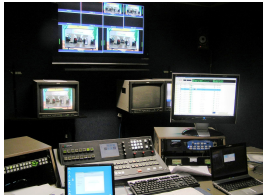
Etere for Imparja