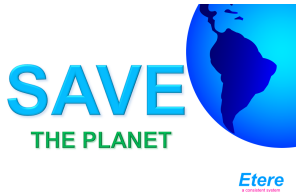
Save The Planet

Etere is a GREEN company. Please help us to reduce the environmental impact by downloading all the information you need from our new corporate site www.etere.com