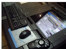
U-Life master control room