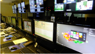
U-Life master control room

U-LIFE, a Taiwan's leading home shopping television network based in Taipei, has chosen Etere to manage the playout of its five cable channels.