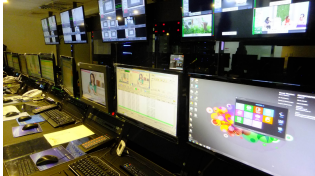
U-Life master control room

U-LIFE, a Taiwan's leading home shopping television network based in Taipei, has chosen Etere to manage the playout of its five cable channels.