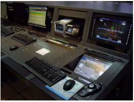
U-Life master control room