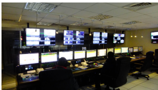
U-Life master control room