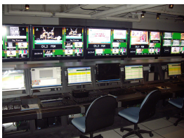
U-Life master control room

U-LIFE has chosen Etere and its Taiwanese partner N-Type to manage the playout of its five cable channels. A distributed Etere system has been deployed to provide U-LIFE with a full-caching environment, enabling them to deliver five different channels via Cable Television. U-Life is using Etere Automation to send on-air five channels' schedules including secondary events such logos and transitions. The overall playout system include a backup automation system ables to replace any Main Automation in case of failure. Moreover, each Automation controls an independent video routers, offering a dedicated management and enhancing the overall playout fault tolerance. Some workstations in Live Studios have been equipped with Matrox XMIO video cards to manage video contents coming from NLE systems and play them in HD format using Etere MTX driver integrated in Etere Cartwall, a powerful tool used in production environment that gives fast access to all video contents and allows to manage simple playlist and manual playout.