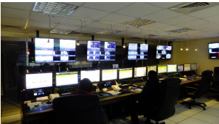
U-Life master control room