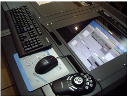
U-Life master control room