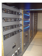
U-Life master control room