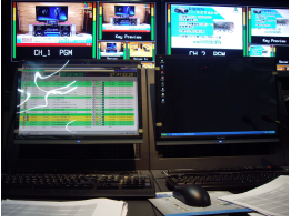
U-Life master control room