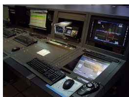
U-Life master control room