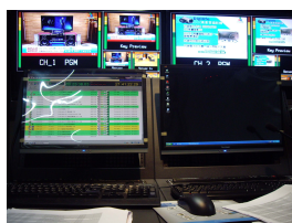
U-Life master control room