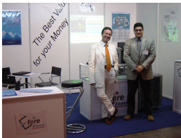
Etere at BCASIA 2002