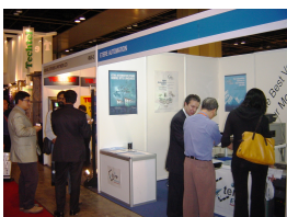
Etere exhibits at BCASIA 2002

ETERE will expose its products even on this year's edition of the major Asian broadcast exhibition, but this year ETERE is going to have its own stand (4N2-3), necessary because of the big success this software-house has in that part of the world.