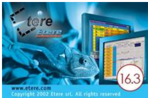
Etere 16.3 software

ETERE will show its software broadcast solutions at the Hall A # 1-2 at STAND PT GALVA TECHNOVISION