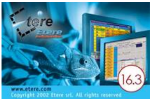
Etere 16.3 software