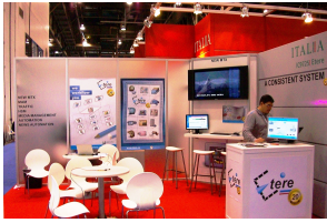
Etere booth at NAB SHOW 2010

Etere Workflow facilitates the management of the entire system by allowing a clear definition and visualization of each complex step of the broadcasting process, becoming into an crucial requisite for the overall system since all Etere modules are capable to use suitable workflows to carry out their work more automatically; multiple workflows can run simultaneously, working independently of each other but inline with the respective process they relate to.