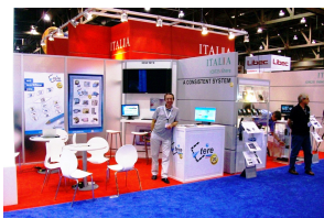
Etere booth at NAB SHOW 2010

NAB 2010 is over and Etere is pleased to confirm the success of its tenth participation at NAB SHOW, Las Vegas Convention Centre.