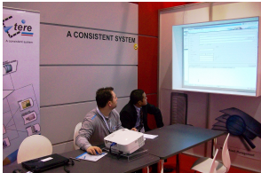
Etere booth at NAB SHOW 2010