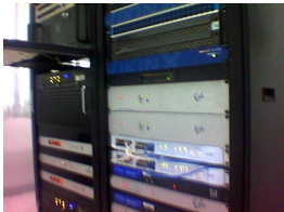
Solar TV Project