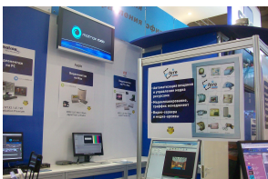
NAT EXPO 2009

ETERE announces its participation at the 2009 edition of NATEXPO, from 17th to 20th November will count with demonstrations of its newest product: Etere MTX, the most advanced, tightly integrated and cost-efficient playout system on the market, completely based on latest Matrox DSX video cards technology.