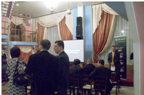
NAT EXPO 2009