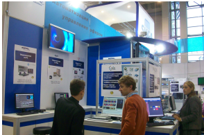
Etere at NAT EXPO