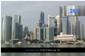
Etere VER 26.1

Etere announced that Etere 26.1 will support the latest generation Linear Tape-Open Generation 7 (LTO-7) technology, driving unrivalled reliability, speed and capacity to address even the most demanding archiving needs.