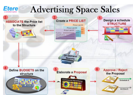
Advertising Space Sales