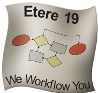
Etere 19 we workflow you