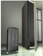
Major Russian Library