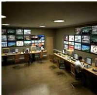
Major Russian Library