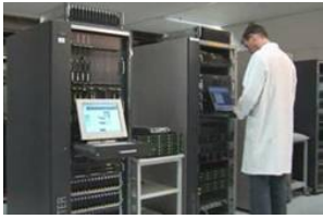
Major Russian Library