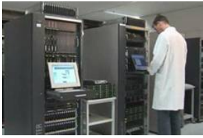
Major Russian Library