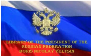
Logo of Major Russian Library

The Major Russian Library Goes Digital and Choose Etere to Deliver its Contents, this ambitious project consists in the creation of the bigger Russian Digital Library.