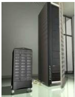
Major Russian Library