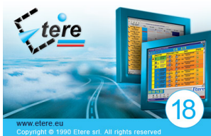
Etere 18.2 software

ETERE software: a benchmark in archiving for the media and broadcasting market.