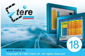
Etere 18.2 software

ETERE software: a benchmark in archiving for the media and broadcasting market.